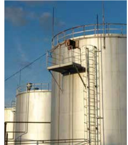
Exploration and Production