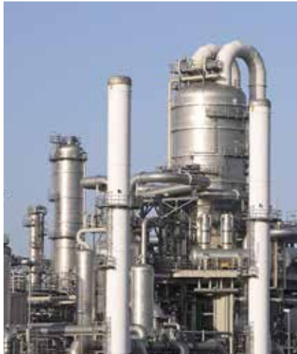
Petrochemical Refining and Chemical