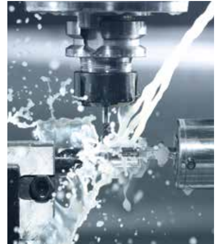
Manufacturing and Machine Tool